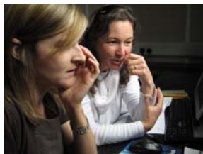
Research Skills Courses