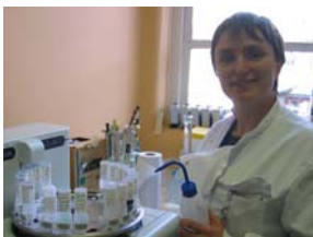
Research Grant Schemes