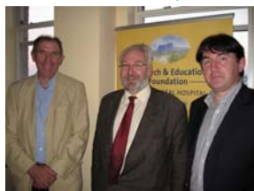
Talks on medical topics