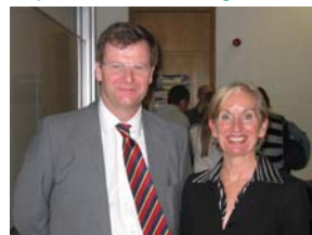
Open Public Meetings